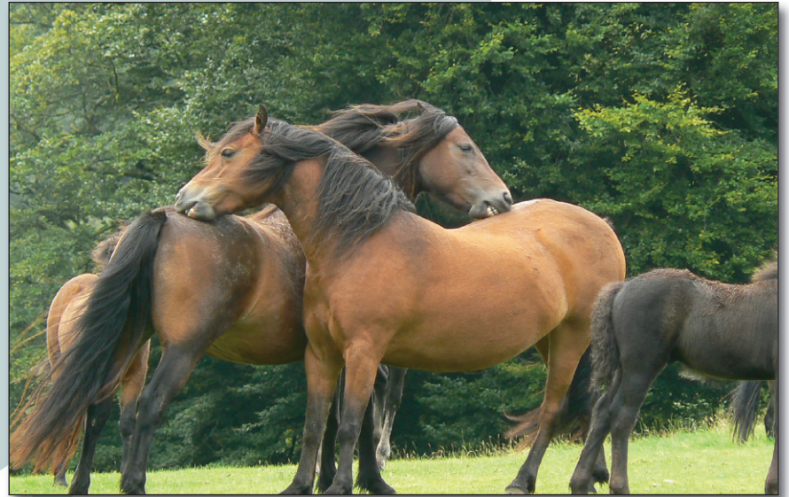
You scratch my back . . . I scratch yours