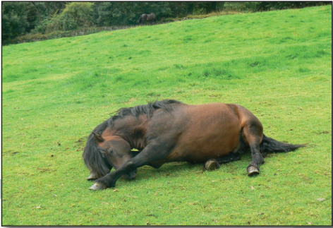
Oh for a good roll.