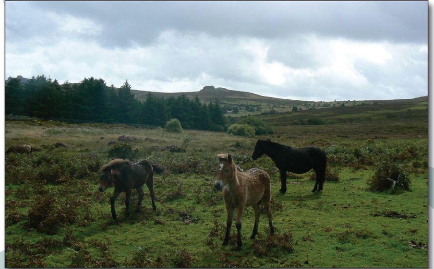
I think it's going to rain.